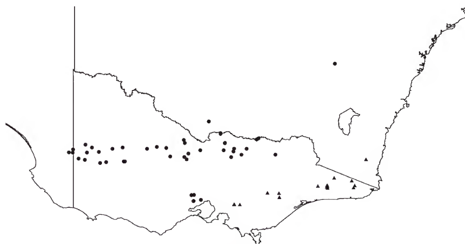
Figure 3. Distribution of Pimelea curviflora subsp. fusiformis (triangles) and subsp. planiticola (circles) based on herbarium collections at MEL and selected specimens from CANB and NSW.

from the Latin for spindle-shaped, a reference to the distinctive shape of the seed.